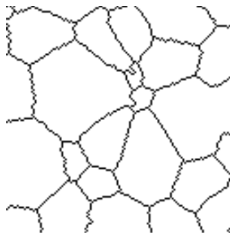
Figure 2a. Zig-zag effect on the borders

allows the suppression of the traditional over-segmentation found in the original watershed algorithm. It avoids the minima detection step and enables the automatic characterization of diverse materials from their segmented images.